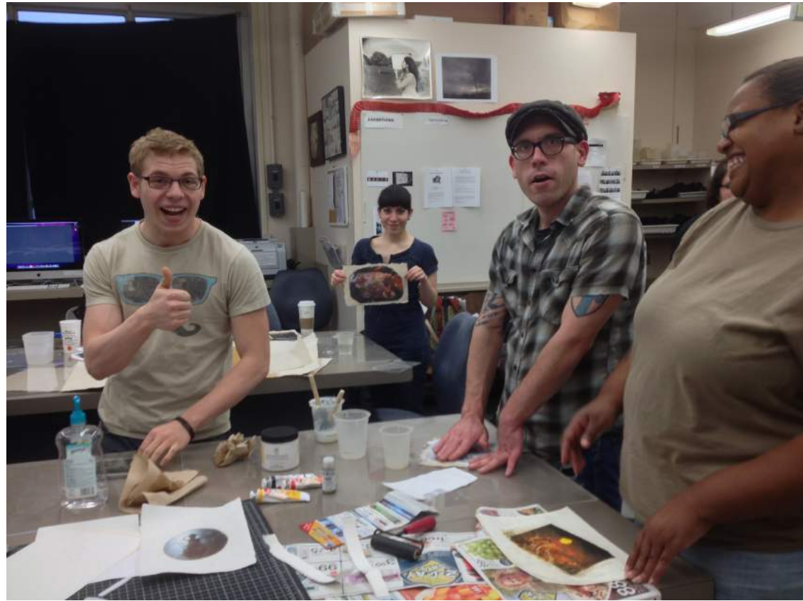
Inkjet and Xerox transfers Alternative Photographic Processes – University of Missouri