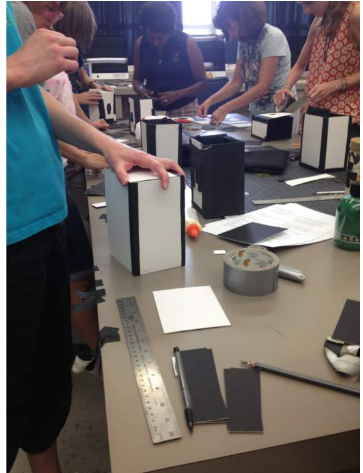
Pinhole Workshop (Organized by the Nelson Atkins Museum of Art and hosted by the University of Missouri )